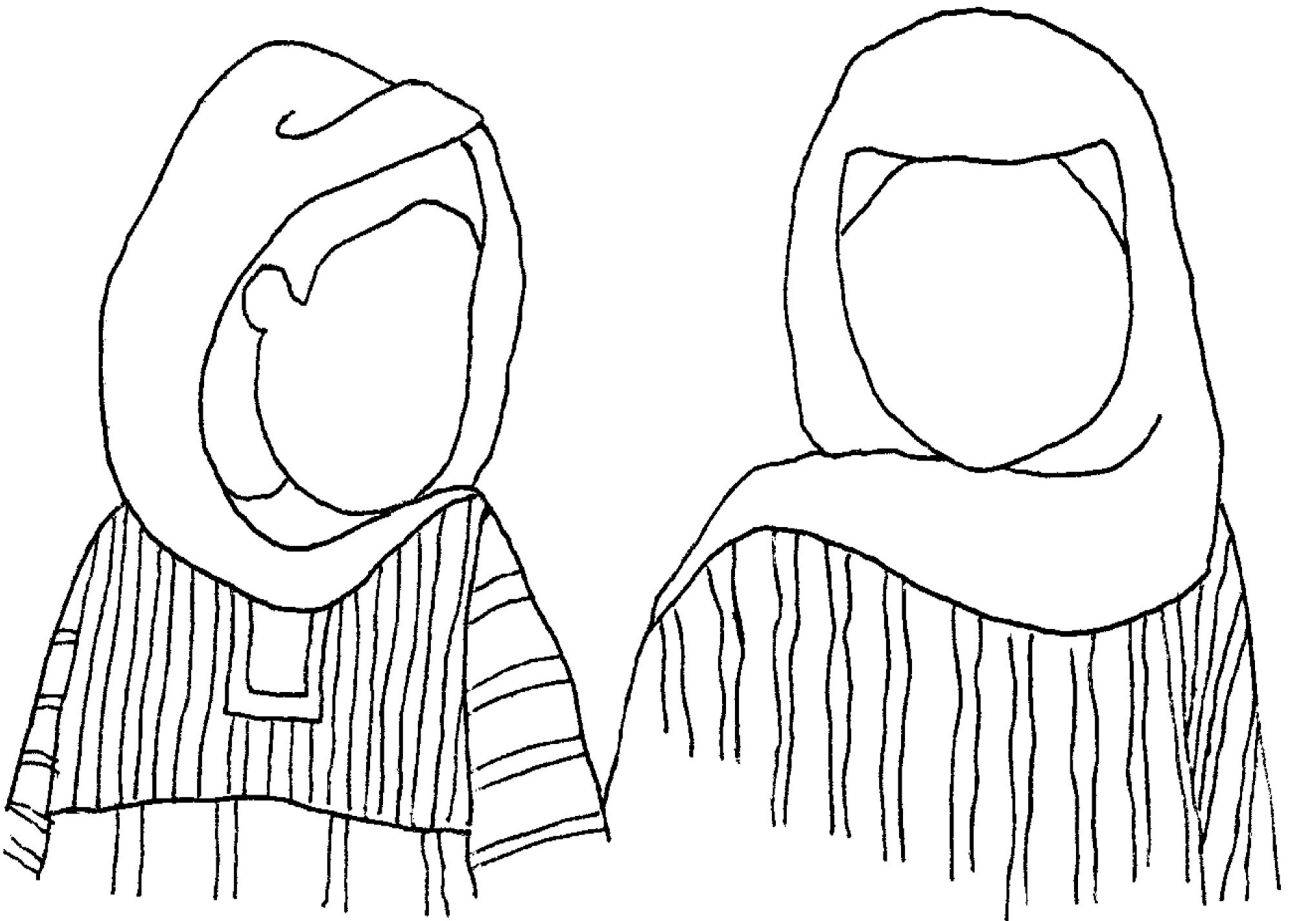
This is Mary and Martha who were sisters. Draw in their faces and colour their beautiful clothes.

Today's we are going to learn about 2 sisters meeting Jesus. Our Bible passage is in Luke Chapter 10 verse 38 - 42